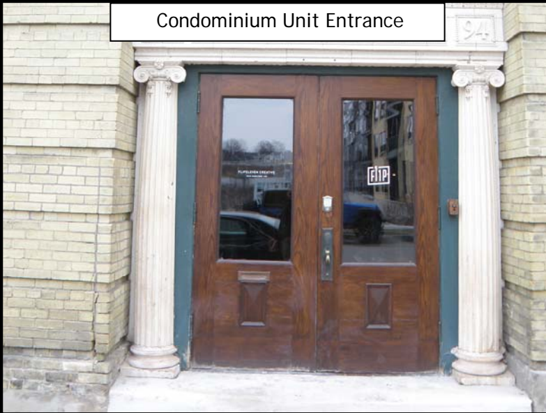
Condominium Unit Entrance