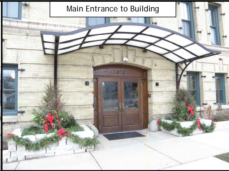
Main Entrance to Building