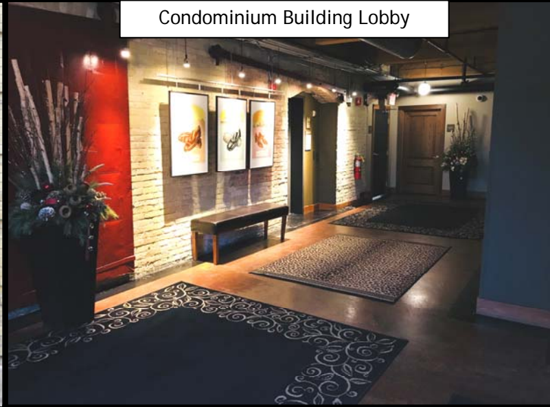
Condominium Building Lobby