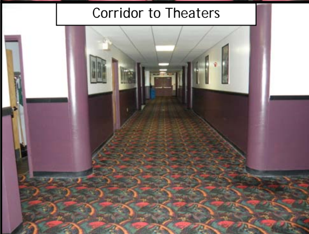
Corridor to Theaters