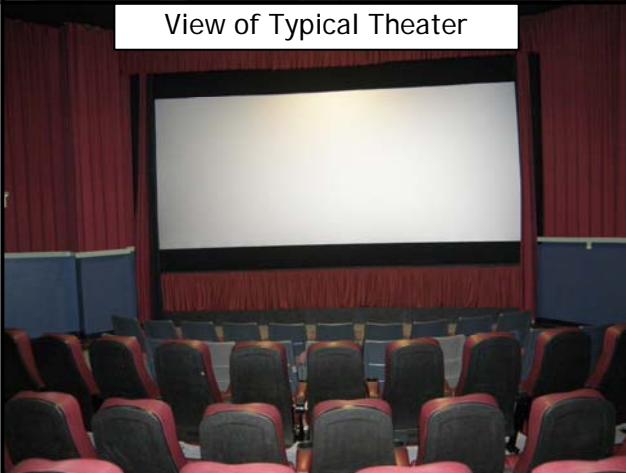
View of Typical Theater