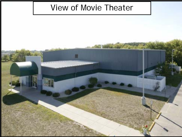
View of Movie Theater