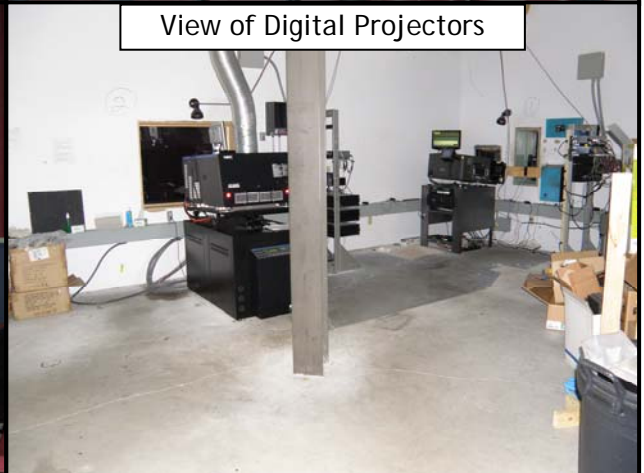
View of Digital Projectors