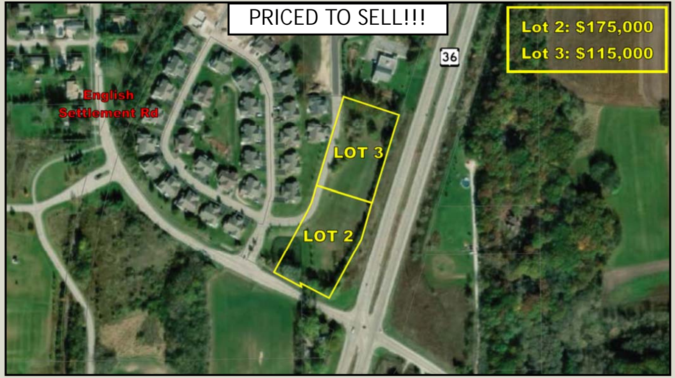
Northwest Corner of State Highway 36 & English Settlement Road | Rochester | Wisconsin

Investment & Rental Property Specialists