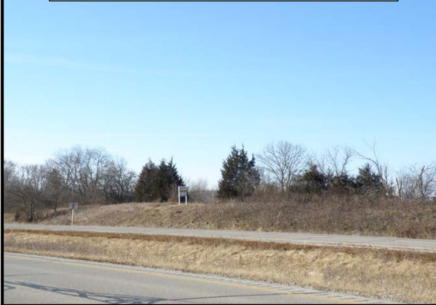
View of Lot 2 - From Oak Hill Circle