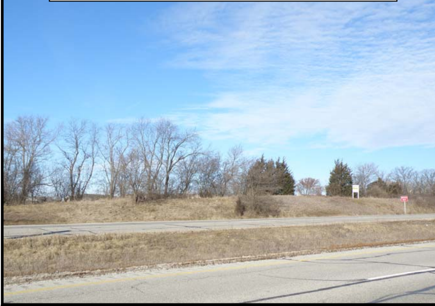
Viewing in a Southwesterly Direction At Subject Lots