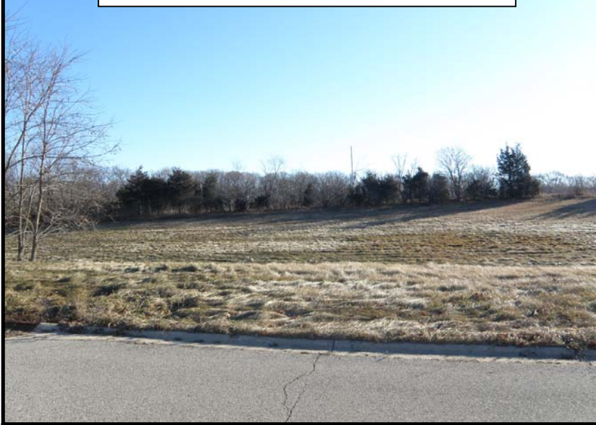
Viewing Northeast at Subject Lots from Adjacent Land