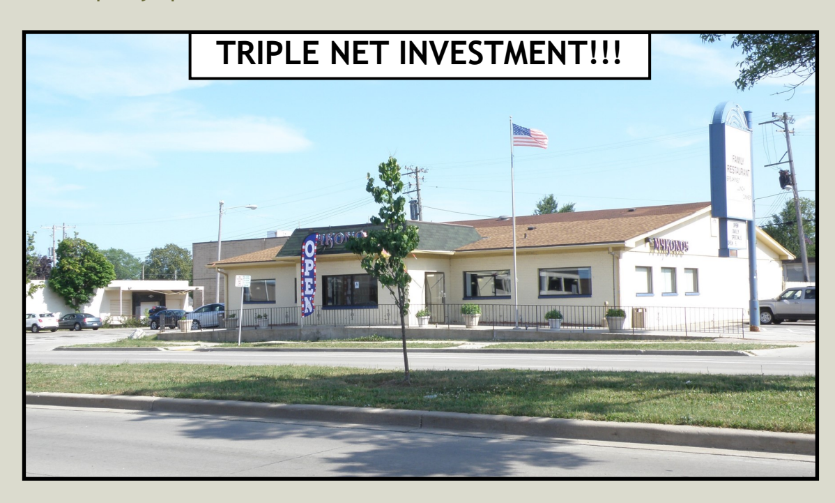
8501 W. Capitol Drive | Milwaukee | Wisconsin | 53222

Investment & Rental Property Specialists