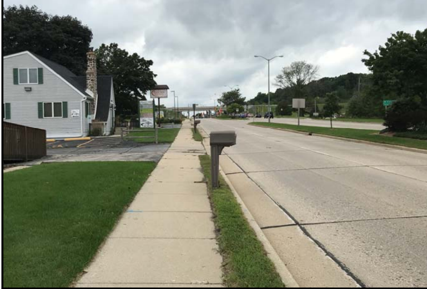
View of West Building on Site