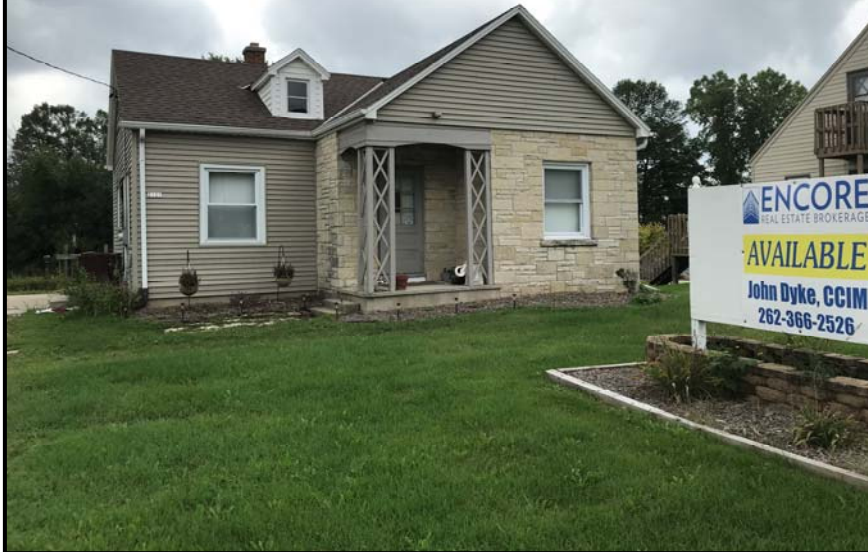
View of East Building on Site