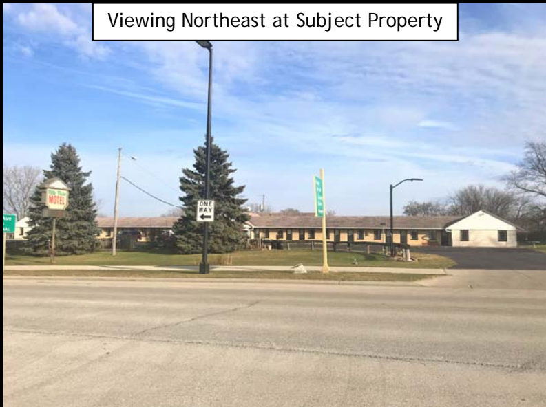
Viewing Northeast at Subject Property