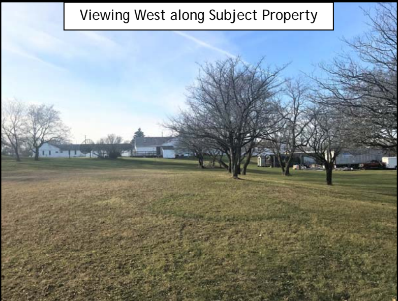
Viewing West along Subject Property