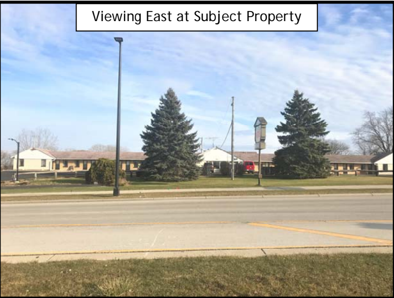
Viewing East at Subject Property