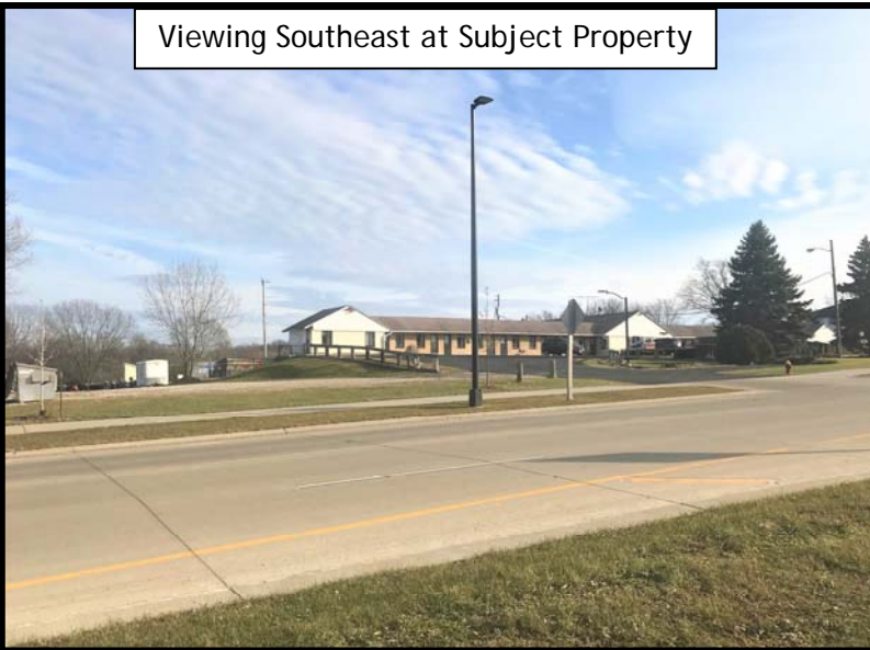
Viewing Southeast at Subject Property