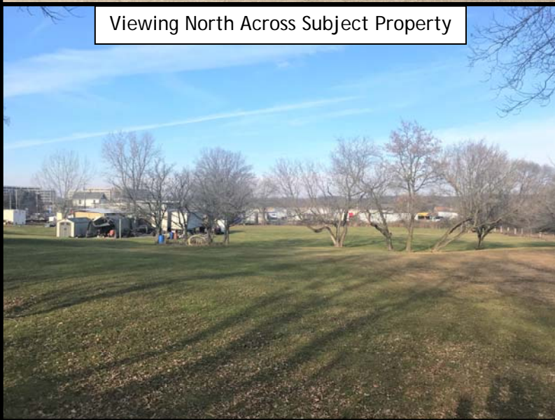
Viewing North Across Subject Property