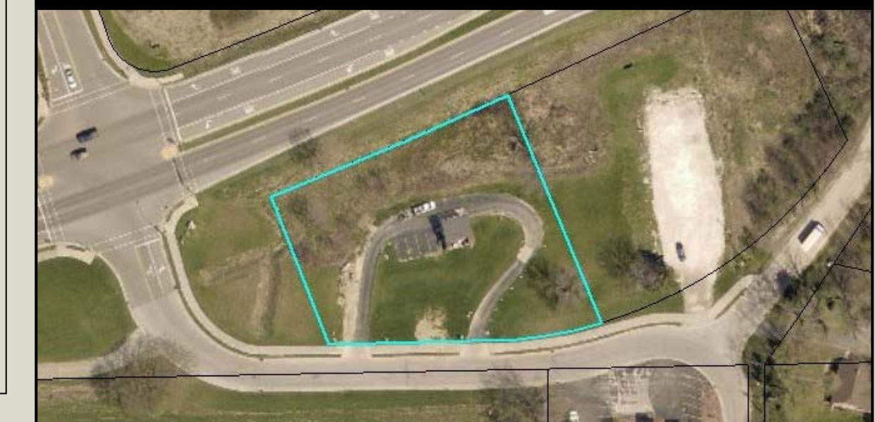
30 S. Pike Lake Drive | Hartford | Wisconsin | 53027